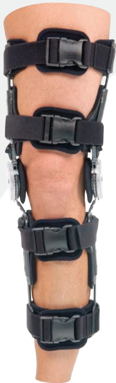
ROM-SS (Breeze Pads)